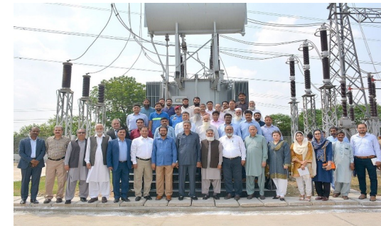
220/132 kV Model Grid Station at TSG training center