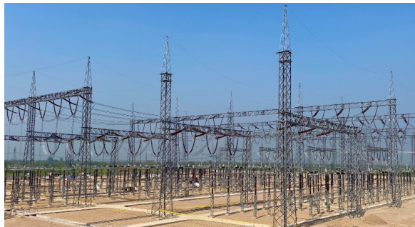
Faisalabad West Grid Station under the PK-P58