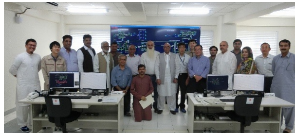
TSG Training center, Lahore